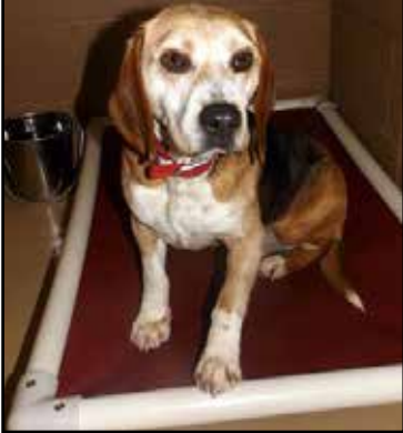
Returned to owner!