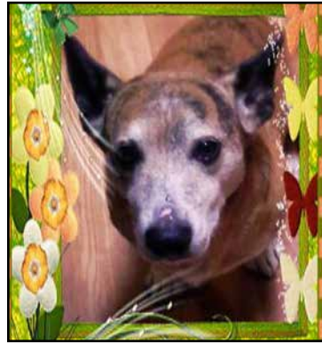
Taz, adopted by Yorch family 10 years ago