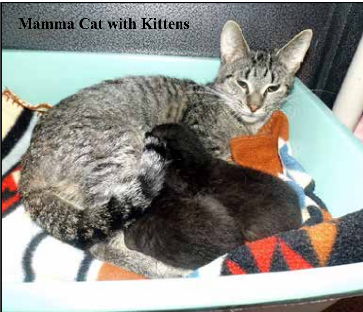
Mamma Cat with Kittens