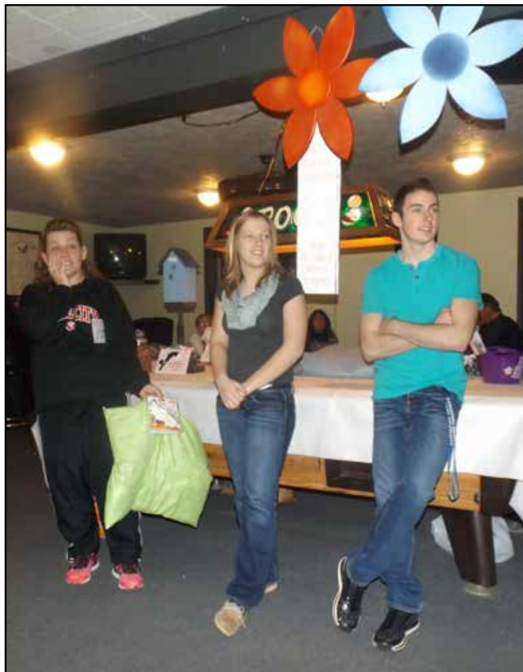
Photos: Top, one of the delicious desserts Center: the crowd settles in for the auction Bottom: Our three auction assistants